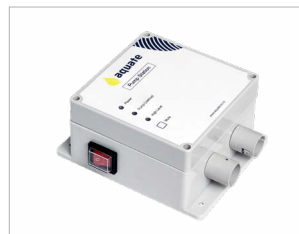
FIG. 2 Controller – manufactured to AS/NZS 3000:2007

For larger systems, additional features can be included if required.